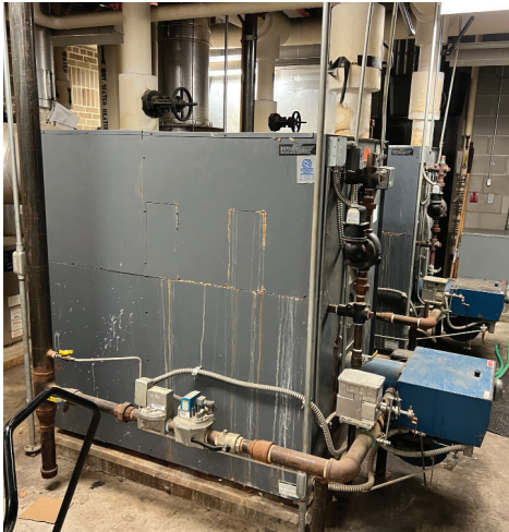
BPS Boilers have reached the end of their useful life and require frequent repair.